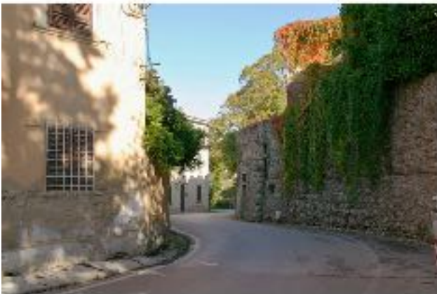
Road to Cevali