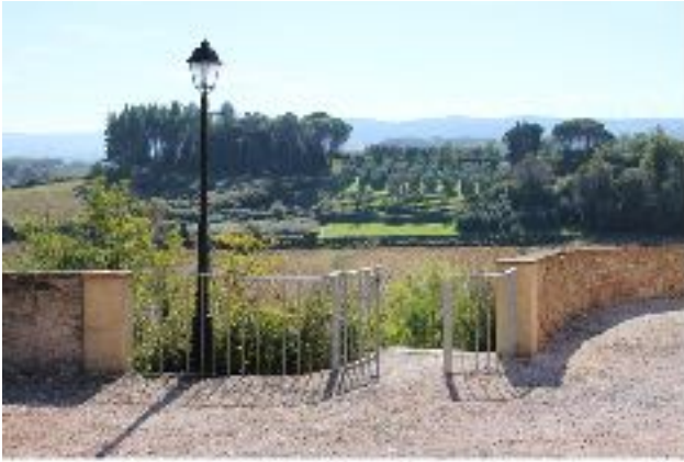
Gate to the swimming pool