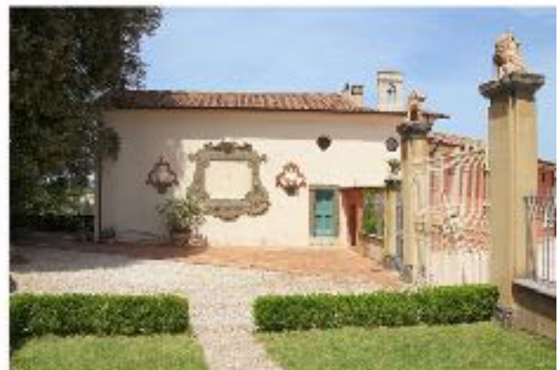
Chapel & farnio