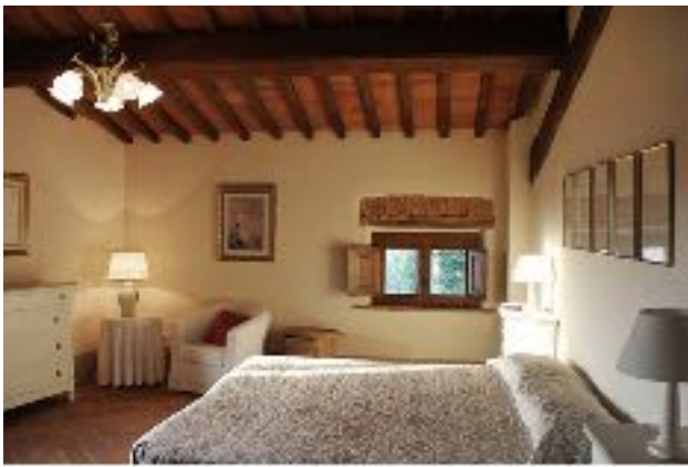
Bedroom 1 - first floor