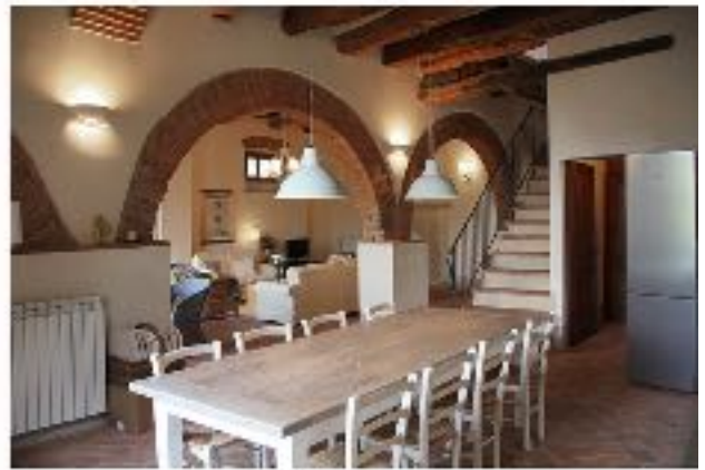
Kitchen to lounge