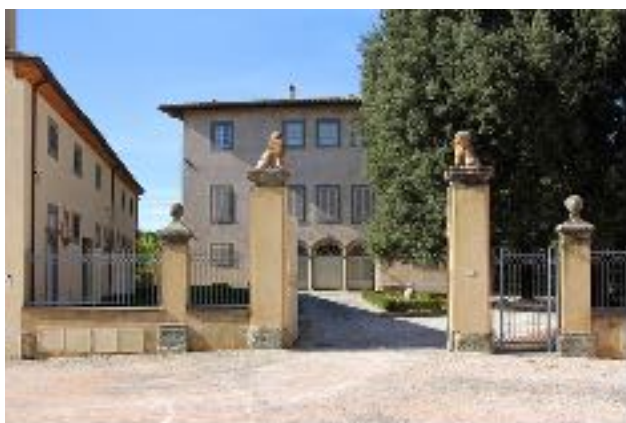
Villa Ceuli main gates

Cevoli sits along the Pisan Wine Road, a picturesque region noted for its fine red wine and exceptional olive oil. Scattered around the surrounding valley are over a dozen small towns, each with their own character, and an interesting array of restaurants and shops. We provide full details of restaurants, markets, and directions for available amenities and interesting destinations for you to explore.