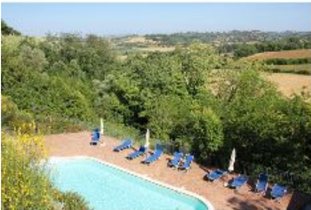
The view from the swimming pool