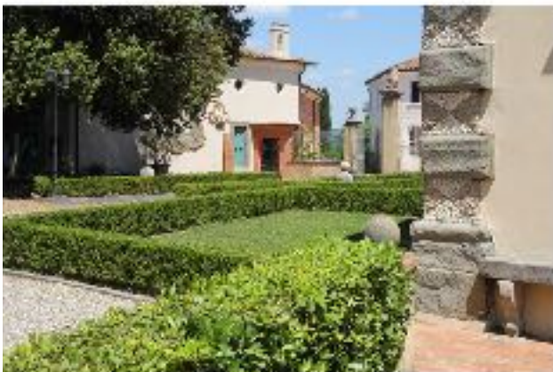
Chapel from apartment garden