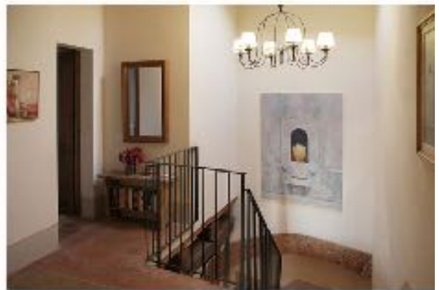
First floor landing