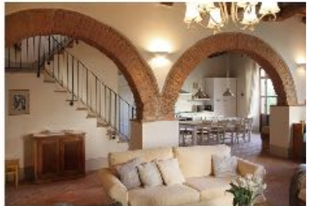
Lounge to kitchen