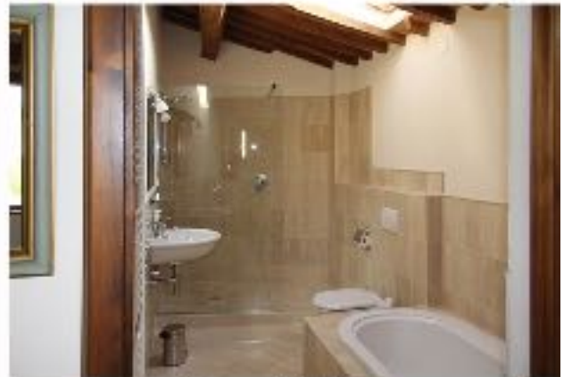
Bathroom 2 - first floor