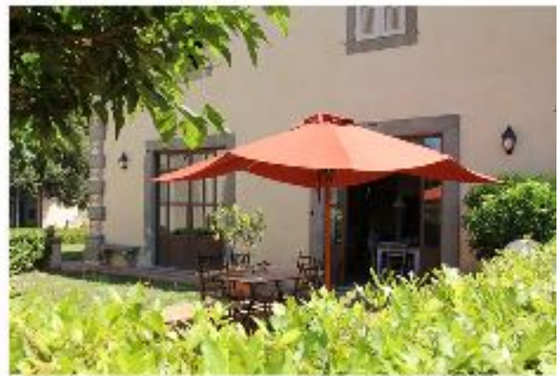
Alfresco dining outside kitchen