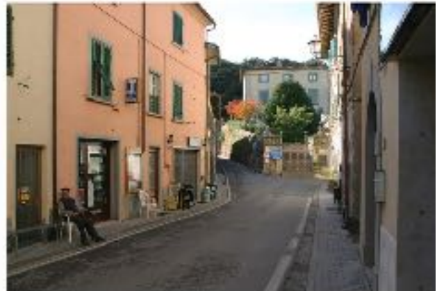
Main street - Cevali