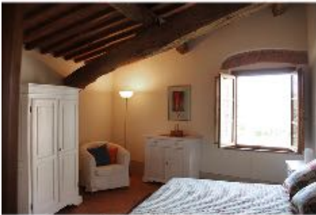
Bedroom 2 - first floor