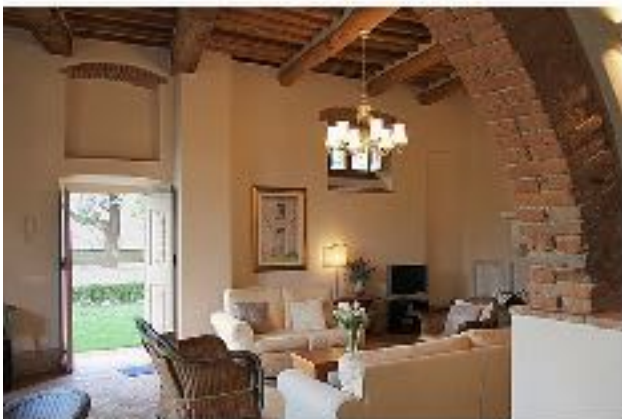
To the front door