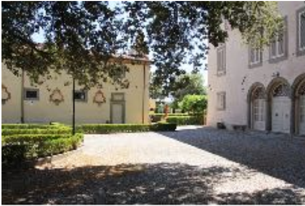
Towards the granato