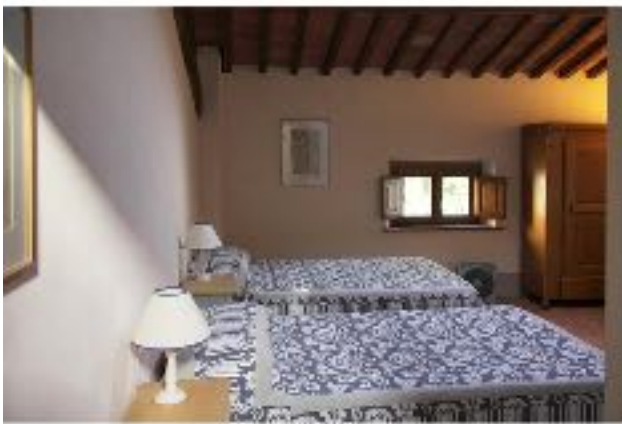
Bedroom 3 - first floor