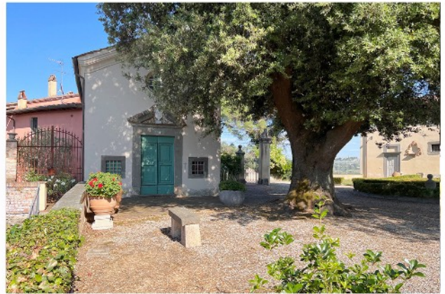
Chapel & frantoio