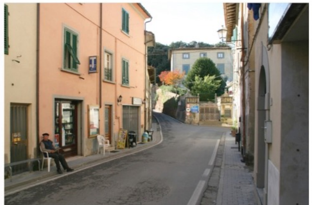
Main street - Cevoli