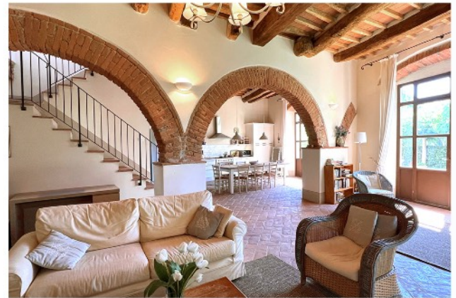
Lounge th kitchen