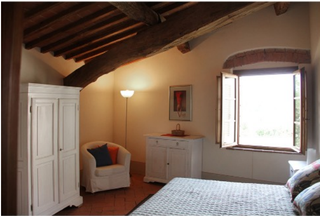
Bedroom 2 - first floor