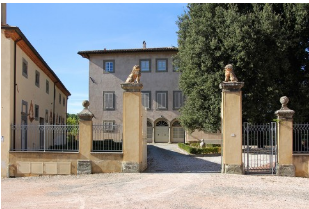
Villa Ceuli main gates

Cevoli sits along the Pisan Wine Road, a picturesque region noted for its fine red wine and exceptional olive oil. Scattered around the surrounding valley are over a dozen small towns, each with their own character, and an interesting array of restaurants and shops. We provide full details of restaurants, markets, and directions for available amenities and interesting destinations for you to explore.