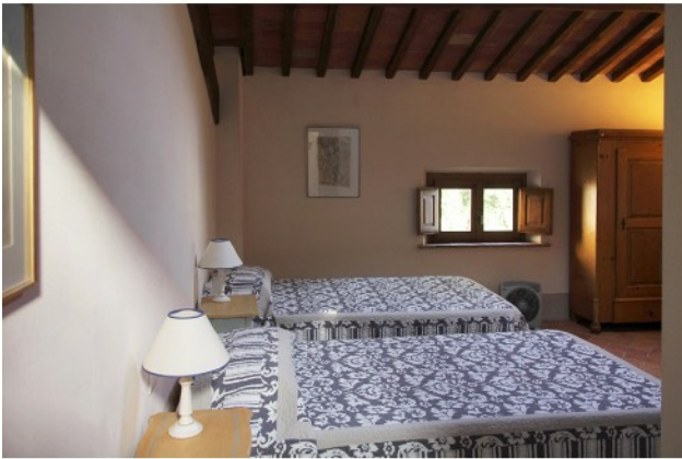
Bedroom 3 - first floor