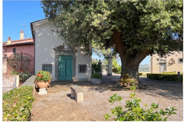
Chapel & frantoio