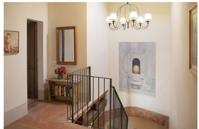
First floor landing