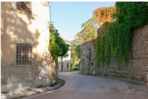
Road to Cevoli