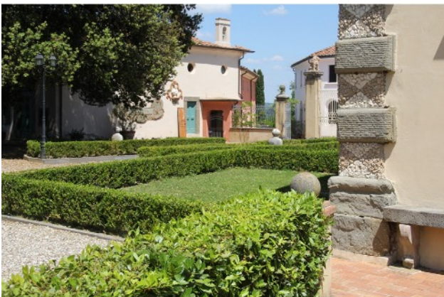
Chapel from apartment garden