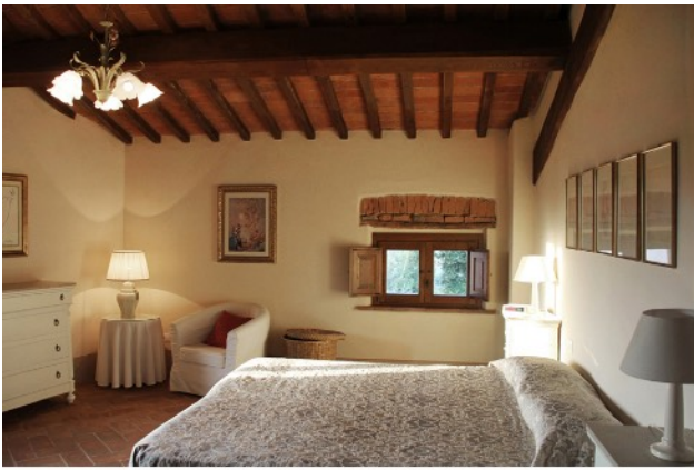
Bedroom 1 - first floor