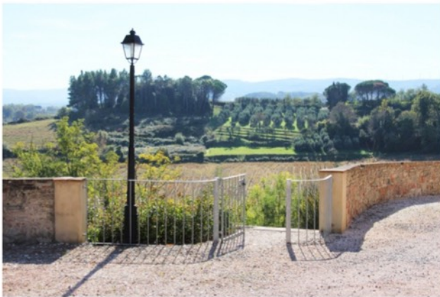
Gate to the swimming pool