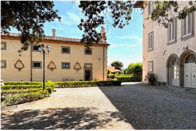
Towards the Granaio