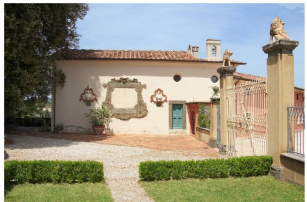
Chapel & frantoio