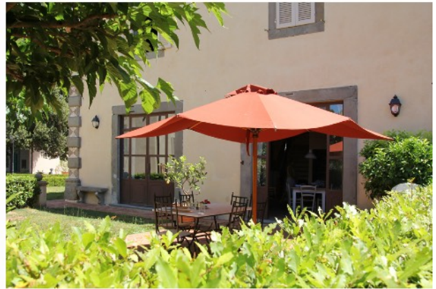
Alfresco dining outside kitchen