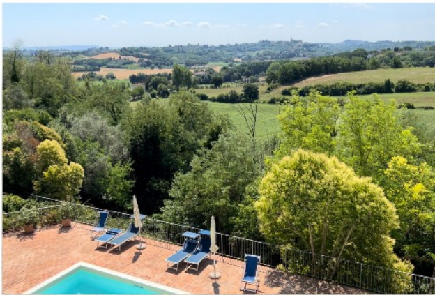
The view from the swimming pool