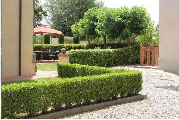
Our private garden