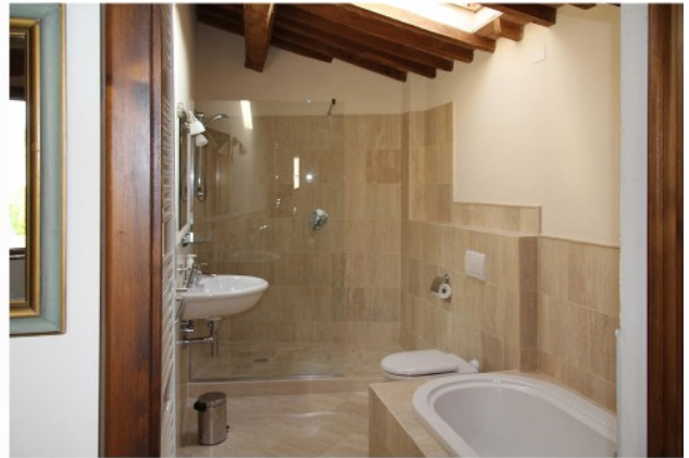
Bathroom 2 - first floor