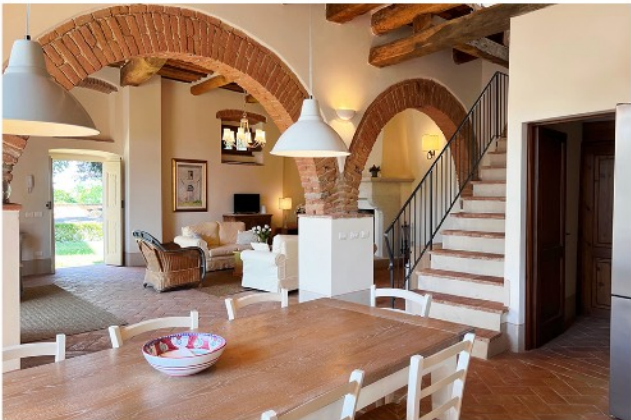
Kitchen to lounge